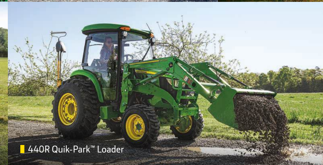
■ 440R Quik-Park™ Loader