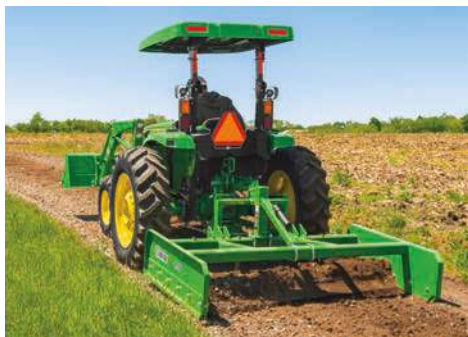
4052M Tractor with a canopy, front loader, and wheel weights. ShadePro Canopy with optional fan is even cooler. See page 4.