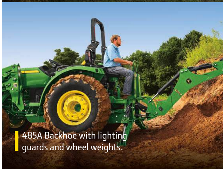
485A Backhoe with lighting guards and wheel weights.