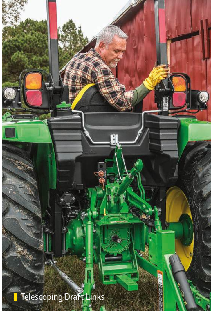
Telescoping Draft Links