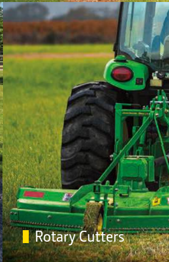
■ Rotary Cutters