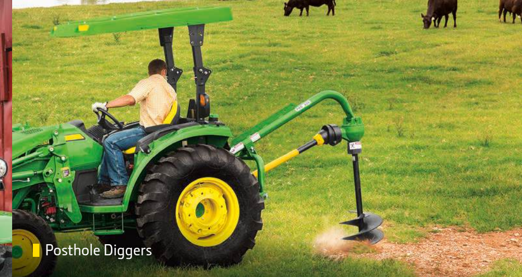
■ Posthole Diggers