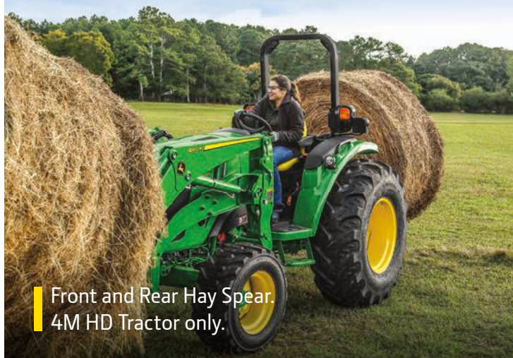
Front and Rear Hay Spear. 4M HD Tractor only.