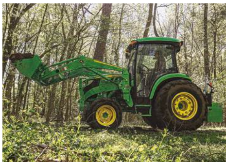
4075R Tractor with 440R Mechanical Self-Leveling Loader (MSL), cab, heat and A/C, and pallet forks. See page 8.