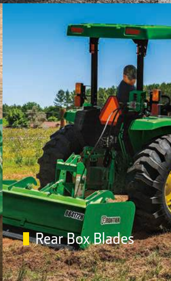
■ Rear Box Blades

Category 1 implements or Category 2 Implements? Many large property owners with big projects and long task lists, landscapers, cow/calf operations and poultry houses use both category 1 and category 2 implements. We offer both. In fact, the category 1, 2 Three Point Hitch on 4M Heavy Duty Tractors make switching between the two categories easy and simplifies inventory management.