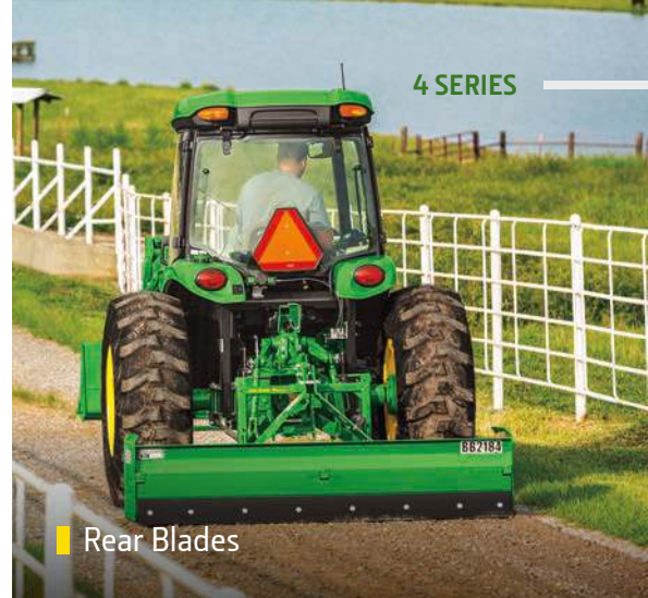
■ Rear Blades