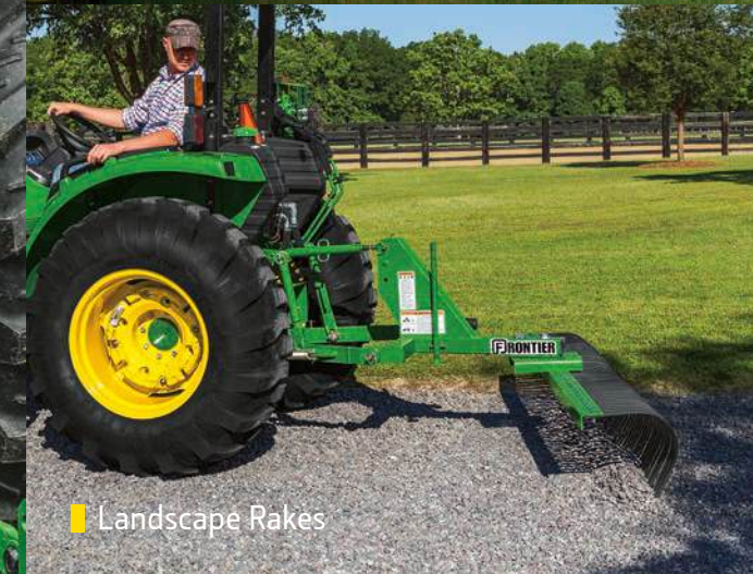
■ Landscape Rakes