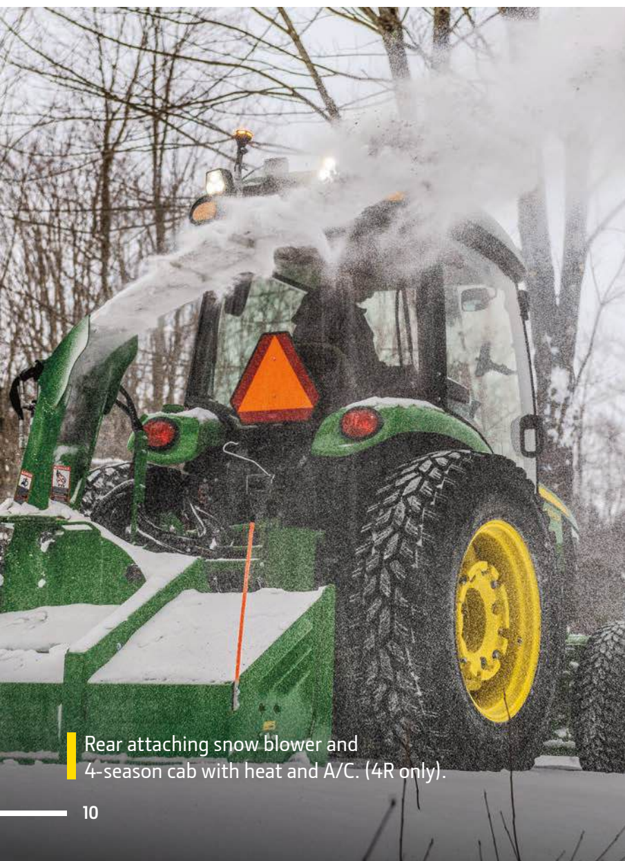
Rear attaching snow blower and 4-season cab with heat and A/C. (4R only).

More than 50 implements and hundreds of attachments are ready and waiting. From front loaders, backhoes and wheel rakes to canopies, work lights and batteries, John Deere and Frontier implements along with quality attachments do it all. Hookup is fast and easy, high performance is a given.